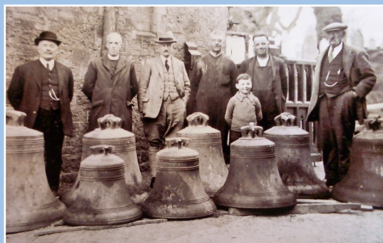
Bells taken down for recasting, 1929